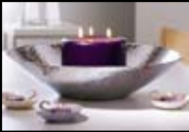
Table of Contents Accessories Candles Flameless Fragrance Personal Care