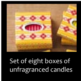
Set of eight boxes of unfragranced candles